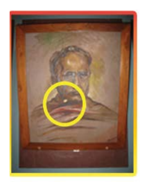
Plate 7 Plate 8