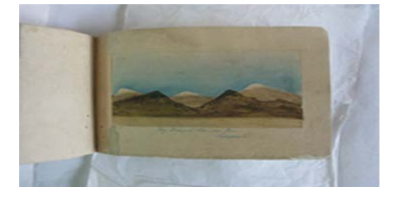
Plate 10b: After Treatment